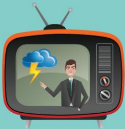
Local TV and Radio