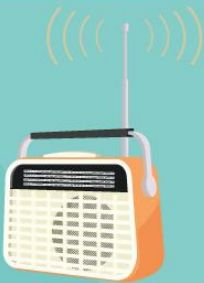
NOAA Weather Radio