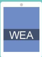
Wireless Emergency Alerts & Weather Apps